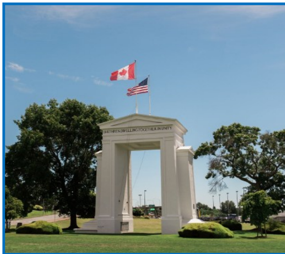
Bring a friend! Bring a potential member**