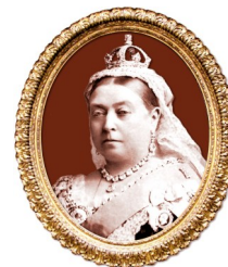
Enjoy my day!