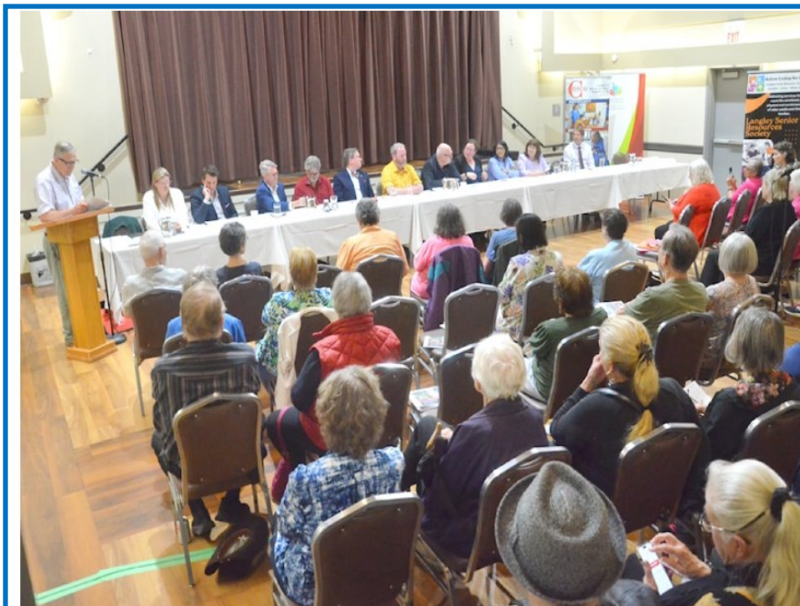
Seniors issues were the focus of an all-candidate forum on Thursday, April 17, 2025, at the Langley Senior Resources Society centre.