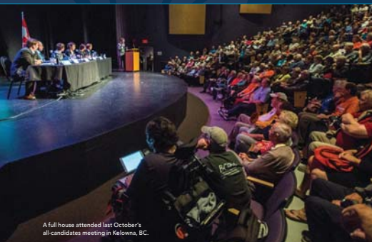
A full house attended last October's all-candidates meeting in Kelowna, BC.