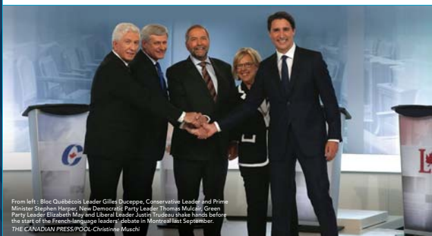
From left: Bloc Quebecois Leader Gilles Duceppe, Conservative Leader and Prime Minister Stephen Harper, New Democratic Party leader Thomas Mulcair, Green Party Leader Elizabeth May and Liberal Leader Justin Trudeau shake hands before the start of the French-language leaders' debate in Montreal last September.

All-candidate events were held in eight of the 12 target ridings, and nearly 24 per cent of our 'non-target' branches held all-candidate meetings — a result which fell short of our goals. Still, our members were kept informed and we engaged with many candidates who promised to respect retirees' pensions and benefits.