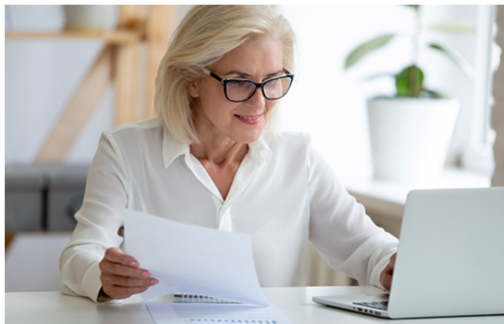
Get retirement-ready with an engaging and informative two-day course from the National Association of Federal Retirees.