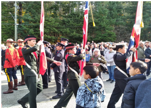
Colour guard at Crescent Beach Legion 240