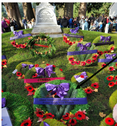
Field of wreaths at Fort Langley (Thanks, Leslie!)