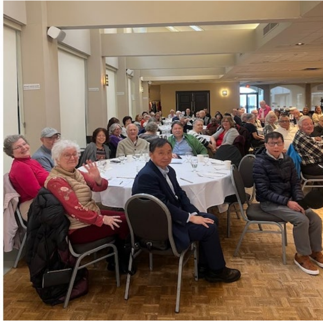
BC08 members enjoying lunch and camaraderie at the 2025 AGM