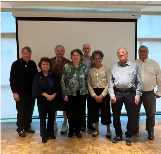
New and outgoing Board Members – April 2025