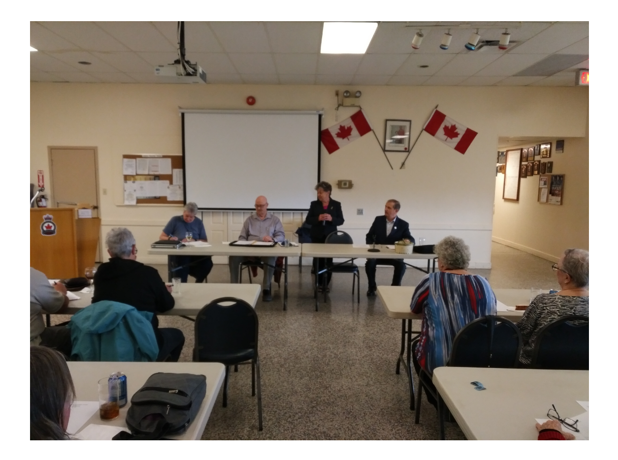
Branch Department Reports