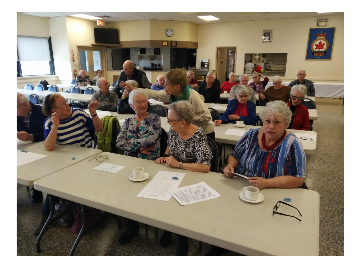
At the end of the day everyone came out as a winner