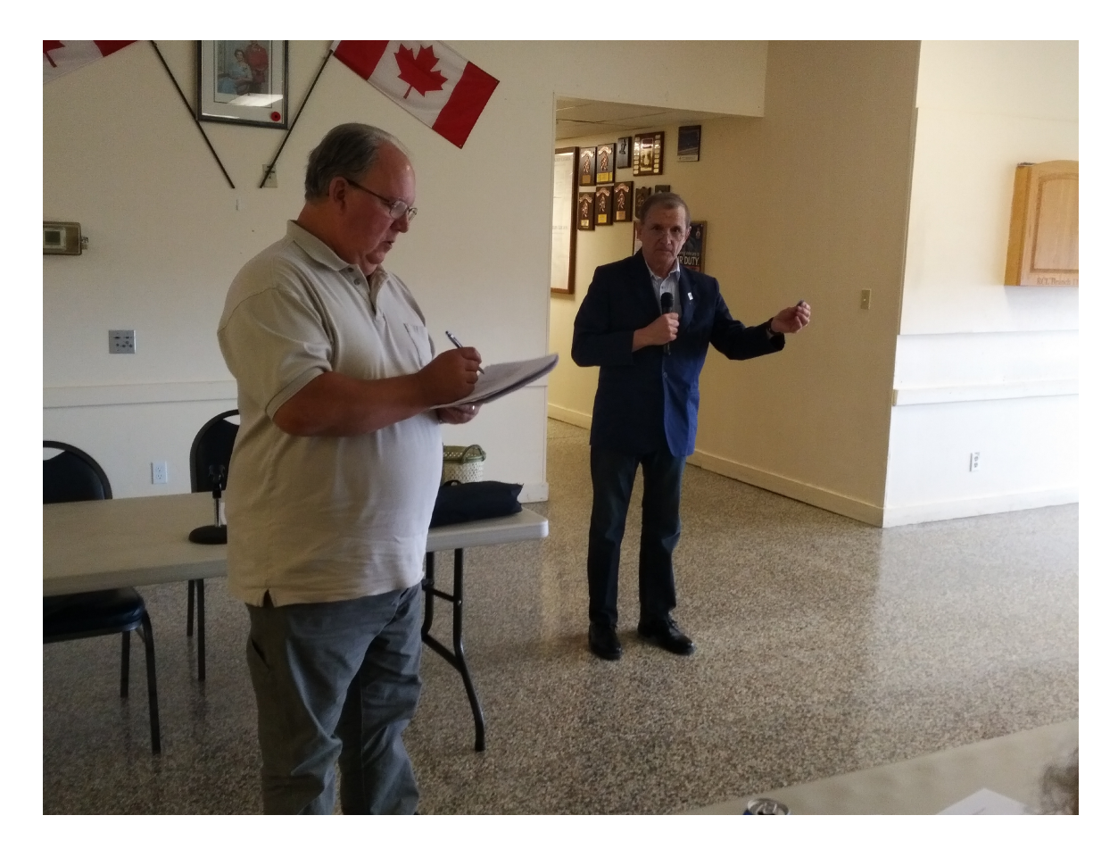
The draw was next and much looked forward to by members in attendance